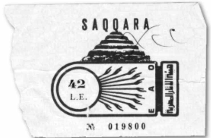
26. Admission ticket to the site of Saqqara