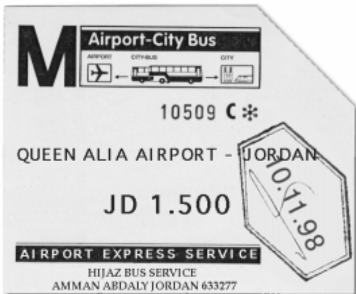
22. Bus ticket, Airport to Amman