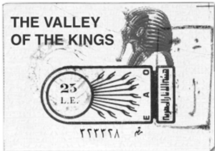
23. Admission ticket to the Valley of the Kings, Thebes